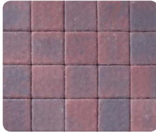
ROSE CREEK BLEND